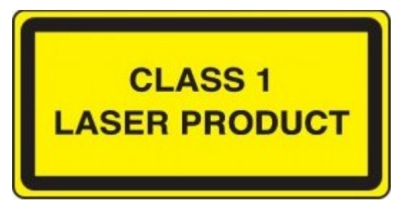
Figure 2. Class 1 laser product label

The laser output power must not be increased by any means and no optics should be used with the intention of focusing the laser beam.