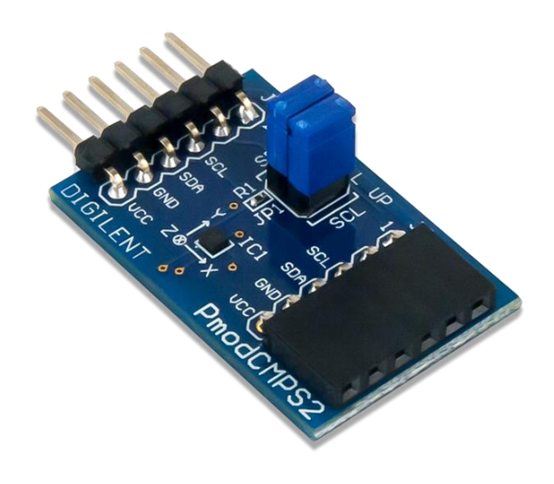
The Pmod CMPS2.

The Digilent Pmod CMPS2 is a 3 axis anisotropic magneto-resistive sensor. With Memsic's MMC34160PJ, the local magnetic field strength in a \pm 16 Gauss range with a heading accuracy of 1° and up to 0.5 mG of resolution.