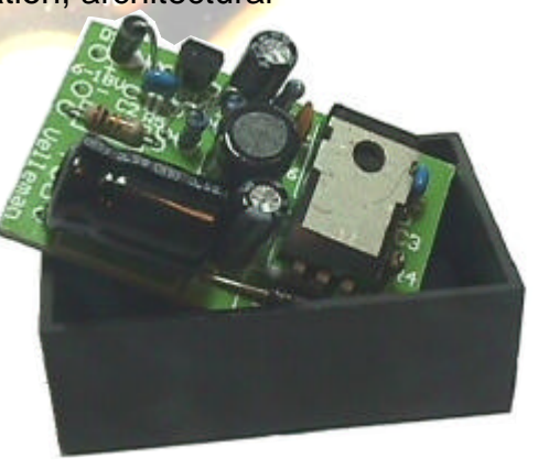
Includes "potting" enclosure