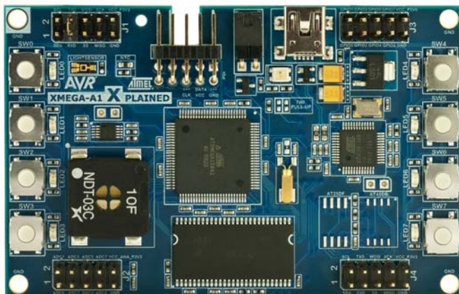
Figure 1-1. XMEGA-A1 Xplained evaluation kit.

The kit offers a larger range of features that enables the Atmel AVR XMEGA user to get started using XMEGA peripherals right away and understand how to integrate the XMEGA device in their own design.