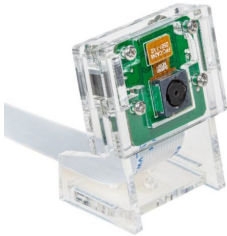
(5MP SKU: B0176)