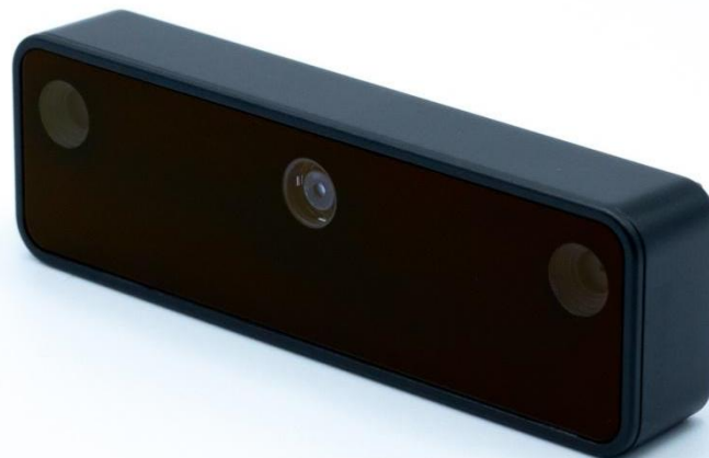
Figure 1 – OAK-D Lite