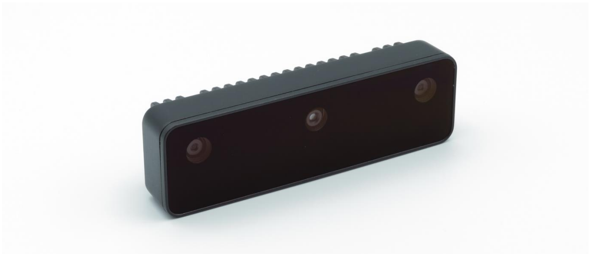
Figure 1 – OAK-D S2