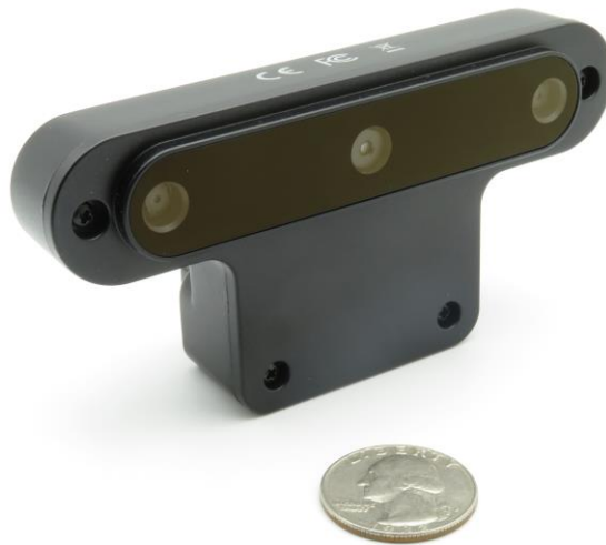
Figure 1 – OAK-D