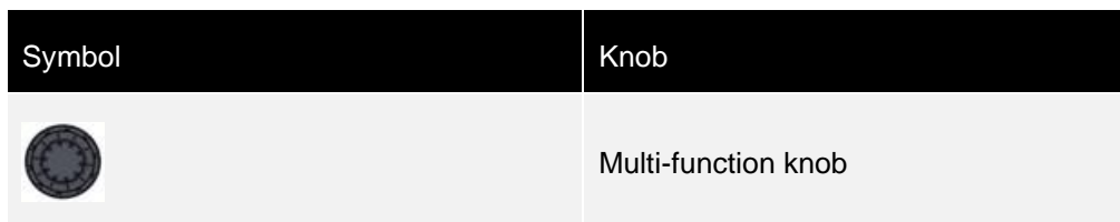
Table 1.1 Knob