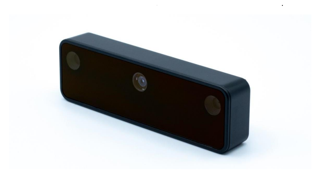
Figure 1 - OAK-D Lite