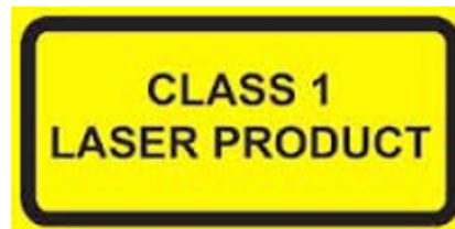
Figure 1. Class 1 laser product label

The laser output power must not be increased and no optics should be used with the intention of focusing the laser beam.