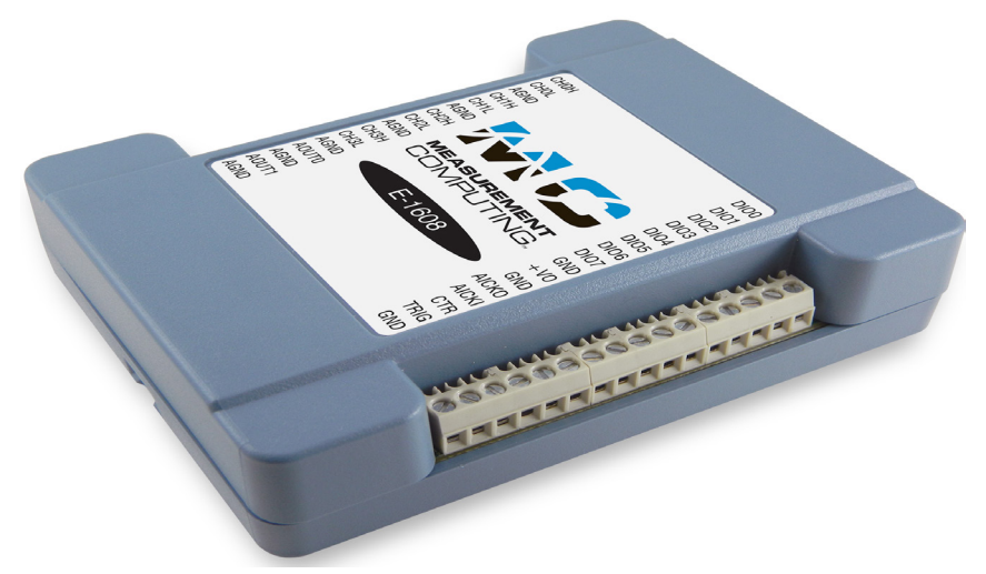
The E-1608 offers high-speed analog input over an Ethernet inetrface, two analog outputs, eight digital I/O, and one event counter input.