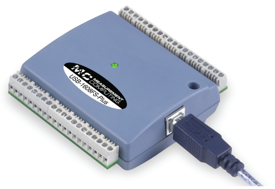
The USB-1608FS-Plus features simultaneous sampling of 8 analog inputs, and also provides 8 DIO lines and a 32-bit event counter