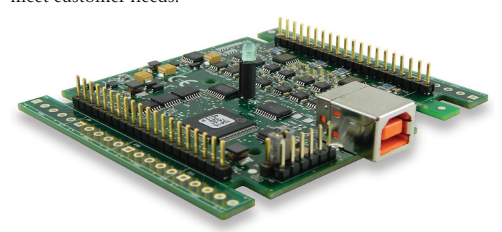
The USB-1608FS-Plus-OEM has the same specifications as the USB-1608FS-Plus, but comes in a board-only form factor with header connectors instead of screw terminals.

The USB-1608FS-Plus-OEM has a board-only form factor with header connectors for OEM and embedded applications (no case, CD, or Ethernet cable). The device can be further customized to meet customer needs.