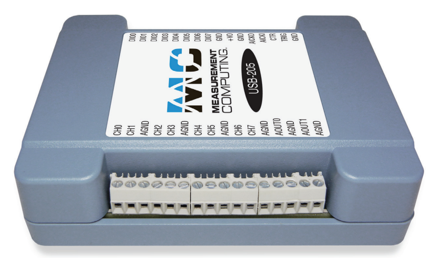
The USB-205 (shown above) provides eight SE analog inputs, two analog outputs, a maximum sample rate of 500 kS/s, 8 digital I/O, and one event counter input.